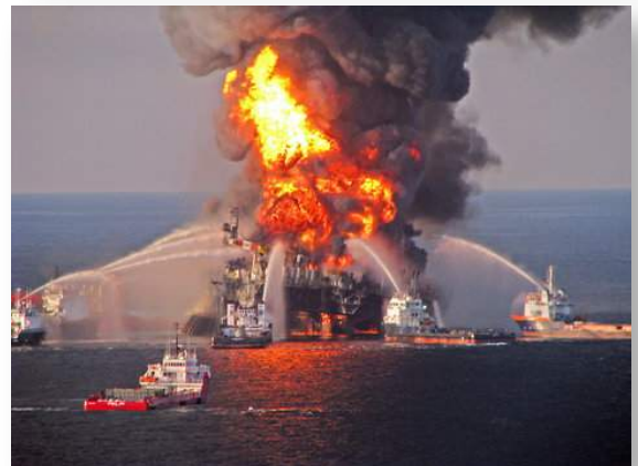
Extensive claims handling experience (Rig Collapse Accident due to shallow gas blowout)